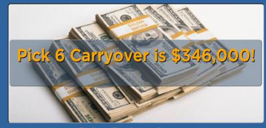
To Start, Touch Anywhere or...