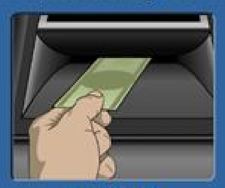
Insert Cash ($1,$2,$5,$10,$20, $50,$100.)