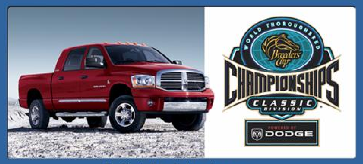
To Start, Touch Anywhere or...