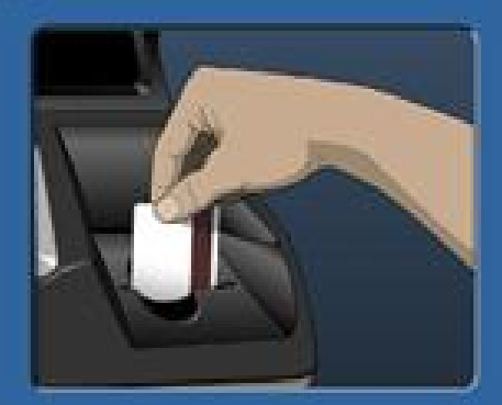
Swipe your Card gunttenore