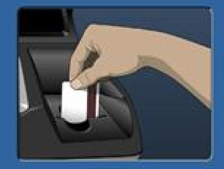
Swipe your Card