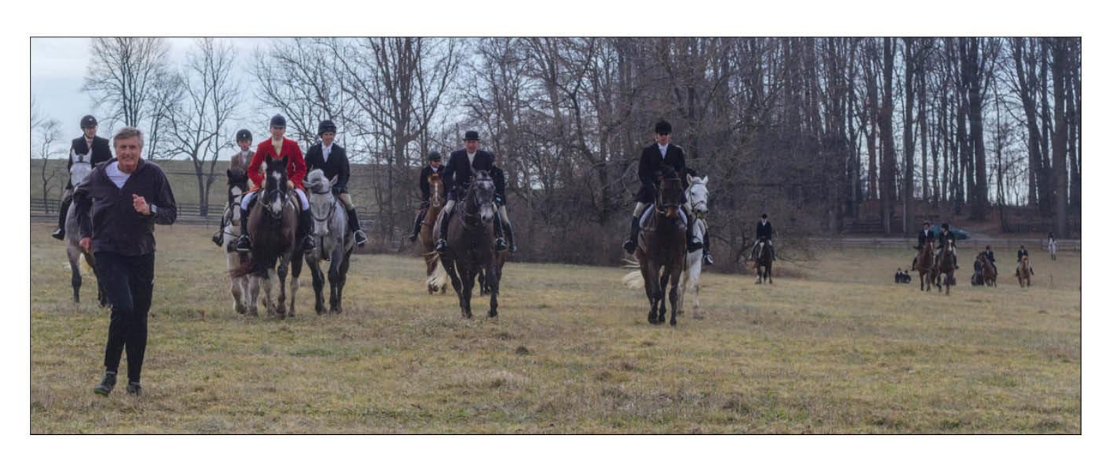
2 Furlongs ahead of the field!