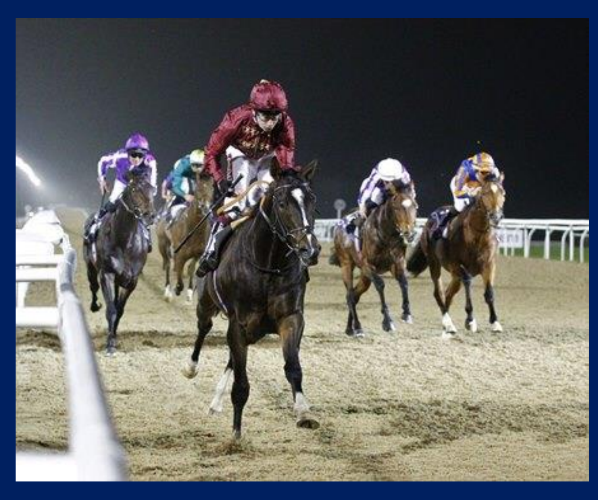
Vertem Futurity, G1, Newcastle

Group 1 Futurity was originally Scheduled for Doncaster with 5 runners. Re-opened 6 days later on Tapeta 10 with 11 runners, plus 4 from Coolmore.