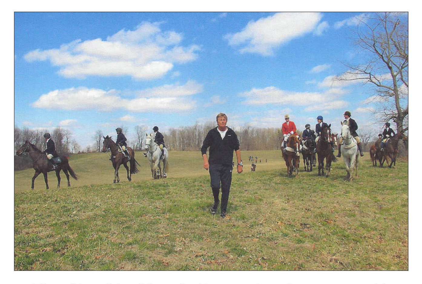
The Cheshire Hunt in Pennsylvania set out with 70 horses and riders and 1 lunatic on his feet.