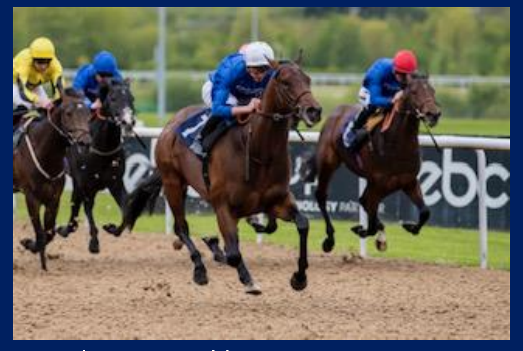
Pinatubo, 2-year old European champion, winner at Wolverhampton, On Tapeta