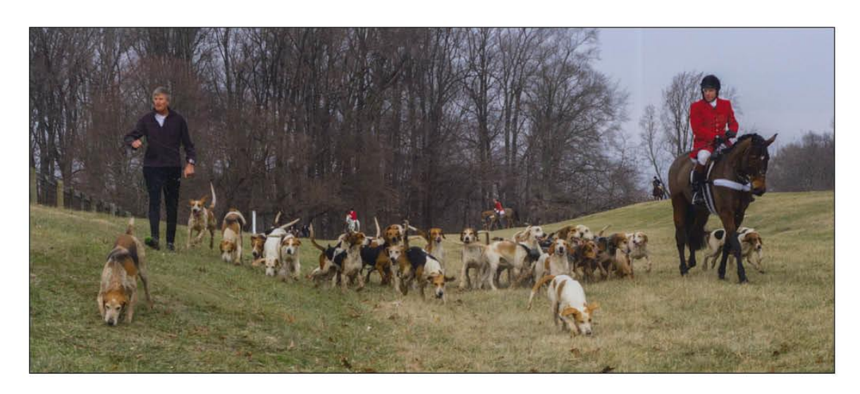
Does the huntsman have a new hound?