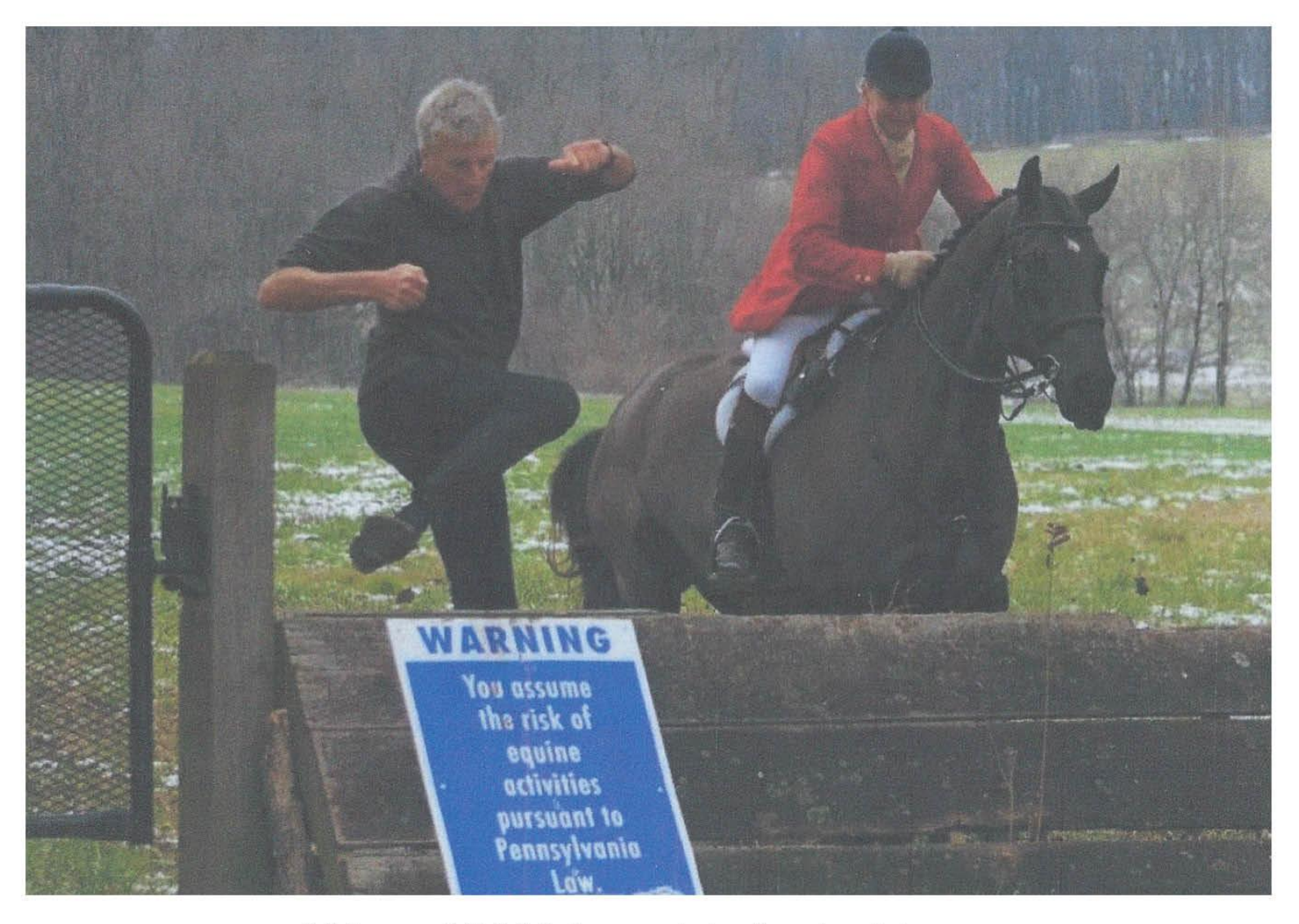
When MWD is on his feet all jumps should carry a warning!