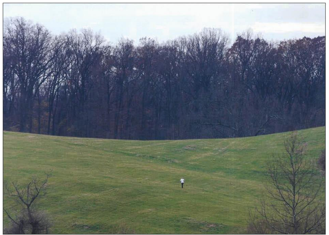
At 3pm .....Where is my compass?!

At the end of the day there are only 10 horses and riders left, plus 1 lunatic who ran 14 miles and 28 jumps!!! 3:30 pm