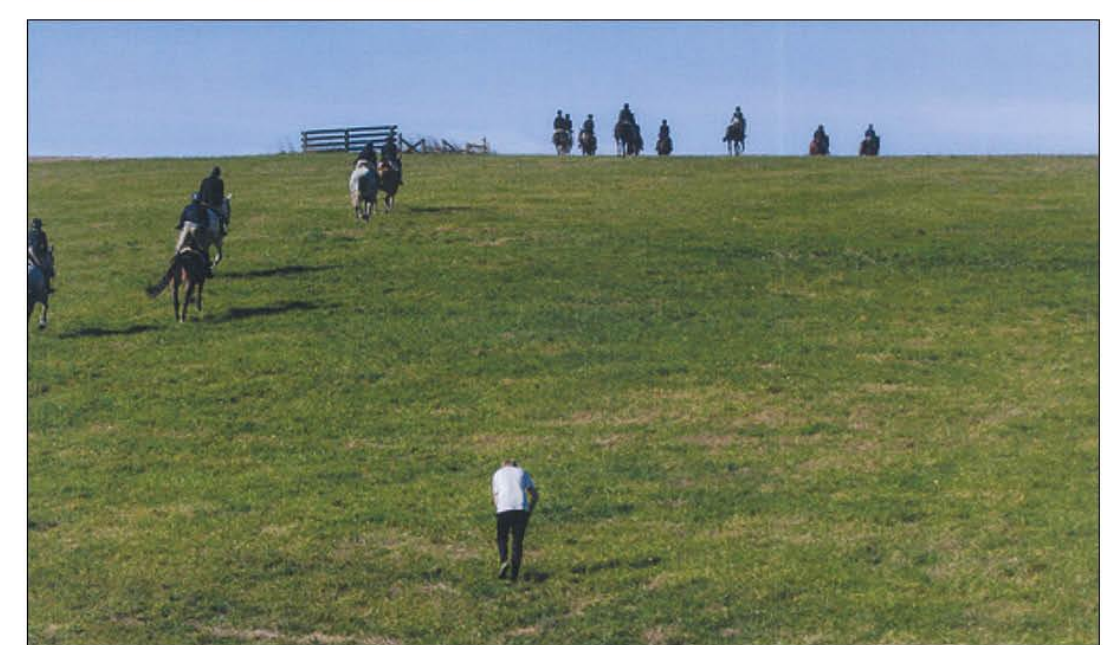
At 11.30am... The hounds are just over the hill... I hope!

In November the Cheshire hounds in Pennsylvania set off with 112 horses and riders and 1 lunatic on his feet at 11am!