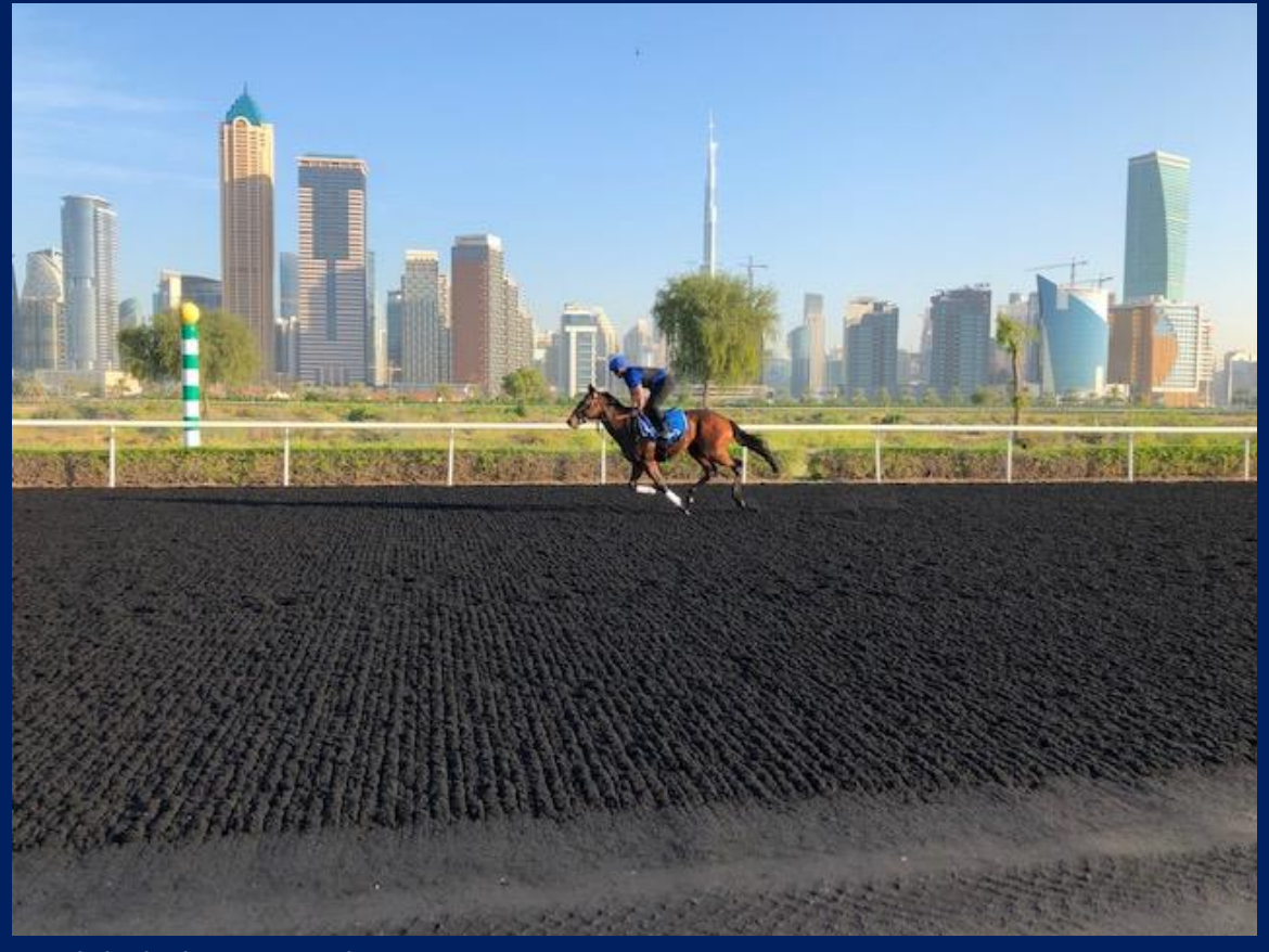
Goldolphin at Al Quaz

In late March + April for 2<sup>nd</sup> lot the temperature can be 90<sup>0</sup> F but the track is still good.